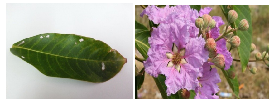
Figure 1: Lagerstroemia floribunda leaves and flower

subtropical and tropical South-East Asia, from southern China to Myanmar, Thailand, Cambodia, Indo-China and Peninsular Malaysia. It's the provincial tree of Saraburi Province in Thailand <sup>1-5</sup>.